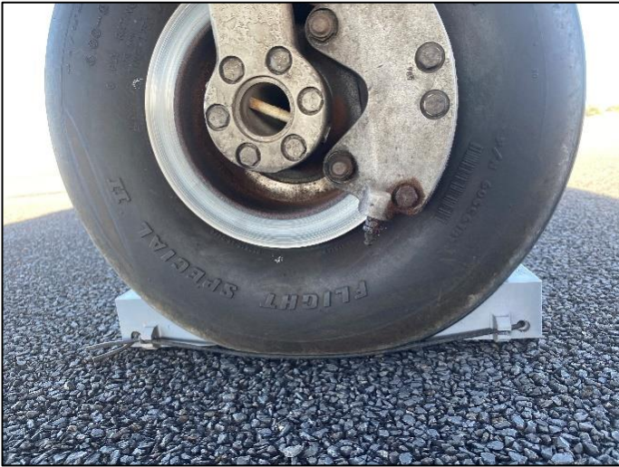
Locked & Chocked