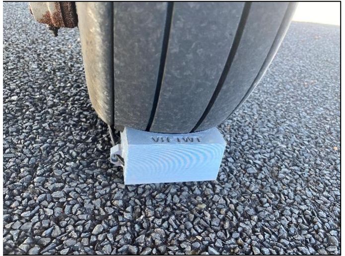
Unique Cupping System