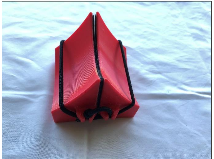
Ready to Travel