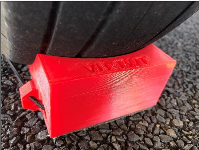
Full Wheel Contact