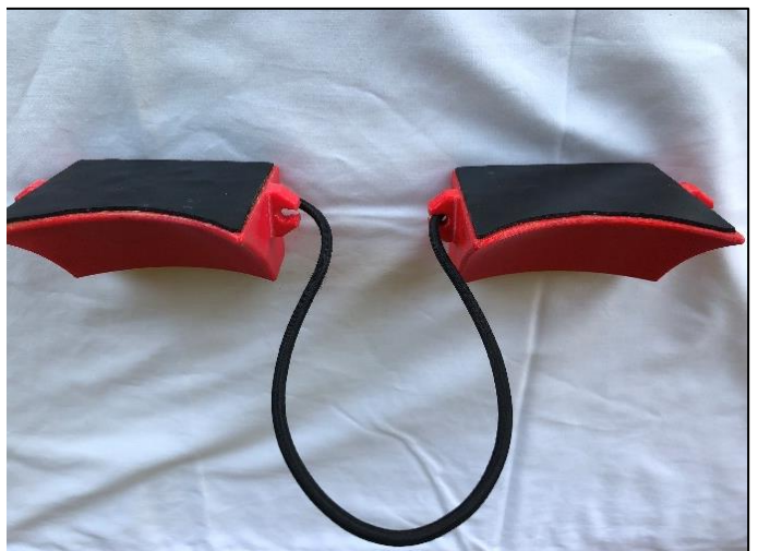
Back Side View